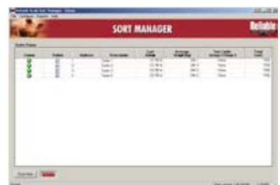
Concise main screen shows overall status at a glance